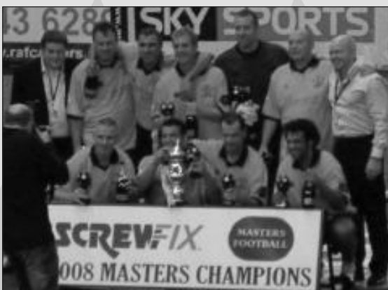
A proud moment for the team's first success in this exciting tournament