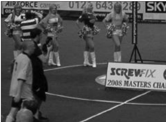
A bevy of cheerleading beauties urging the teams (and the spectators) on.