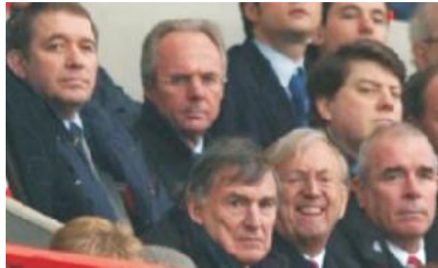
round, that when the name Wolverhampton was mentioned Sven said "where is that?!"!!!!!!