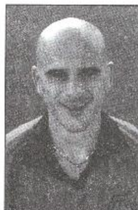
Attacking midfielder Temuri Ketsbaia joins from Newcastle.